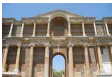
Churches of Revelation

Plus: Gallipoli Aphrodisias Antalya Pamukkale